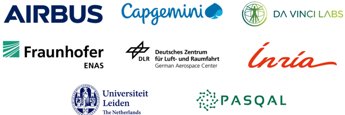
Figure 1: EQUALITY Consortium.

Da Vinci Labs is a research and incubation structure inspired by Leonardo da Vinci. Its interdisciplinary and humanistic approach aims to respond in a competitive way to the ecological challenges of tomorrow and to bring out the future champions of deep tech in the field of quantum technologies, artificial intelligence, and synthetic biology. To do this, Da Vinci Labs participates in European collaborative research projects and builds a technological infrastructure in Touraine, which will be available to researchers and entrepreneurs ready to tackle our significant societal challenges.